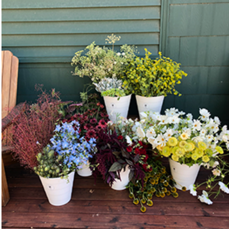
A collection of DIY kits ready for a September wedding